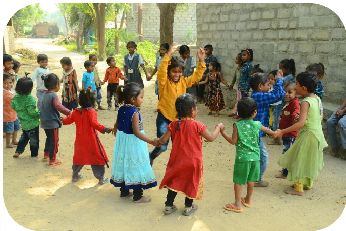
Educational and recreational activities and nutritious meals for children at the Balwadi