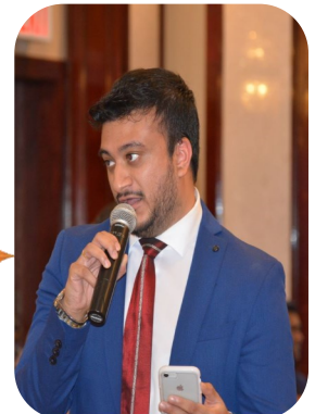
Announcements and Vote of Thanks