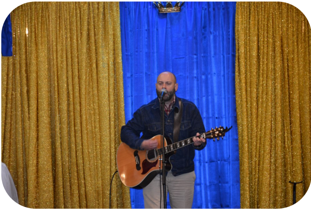
Music Performance at SCI's Annual Fundraiser Program, Sept 2018

Street Children International's annual fundraising program in 2018 included a multi-cultural event featuring music and dance performances by local artists. Handouts featuring the activities of SCI-supported schools were distributed to the attendees to raise awareness about SCI's mission. Testimonials from the pavement school children provided a glimpse into SCI's continued effort to support education, nutrition, clothing, and basic needs of well-being that ensures the children's survival in a cleaner and healthier way.