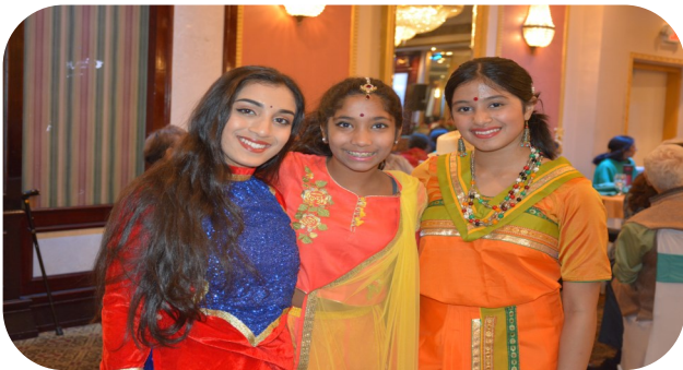
Local Dance Performers at SCI's Fundraiser Program