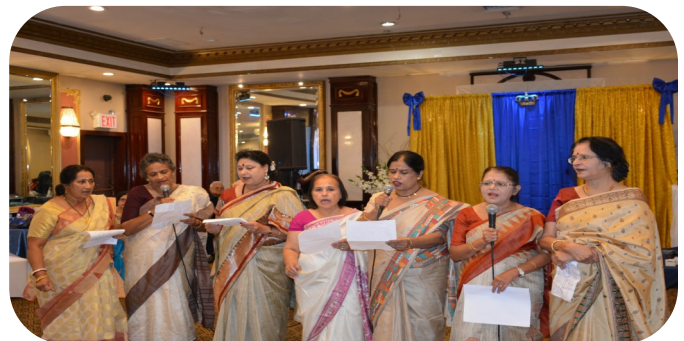
Chorus performance by SCI Members at the Annual Fundraising Event, Sept 2018