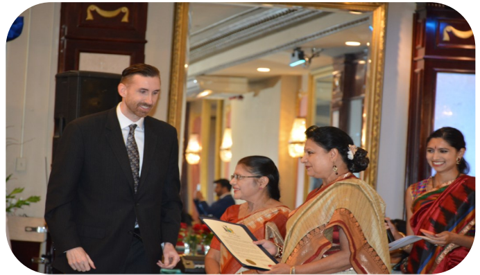
Proclamation presented to SCI from the Comptroller's Office, State of New York