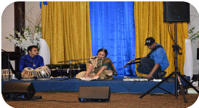
Performances by local musicians from New York