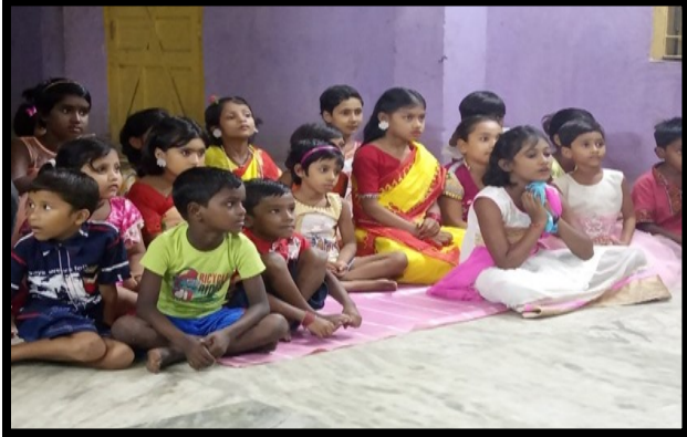
Students of Mantra at a local community event

MANTRA organizes periodic cultural events where children are encouraged to show their talent and skills to their guardians and other neighborhood residents. These events encourage children to come to MANTRA in a sustained way and develop an interest in their curricula based studies. The children's families and caregivers become sensitized about their own responsibilities towards the children in this process.